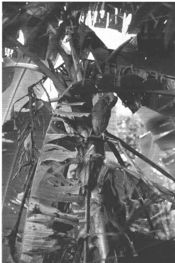
Figure 1. Madagascar Red Owl at a roost site.